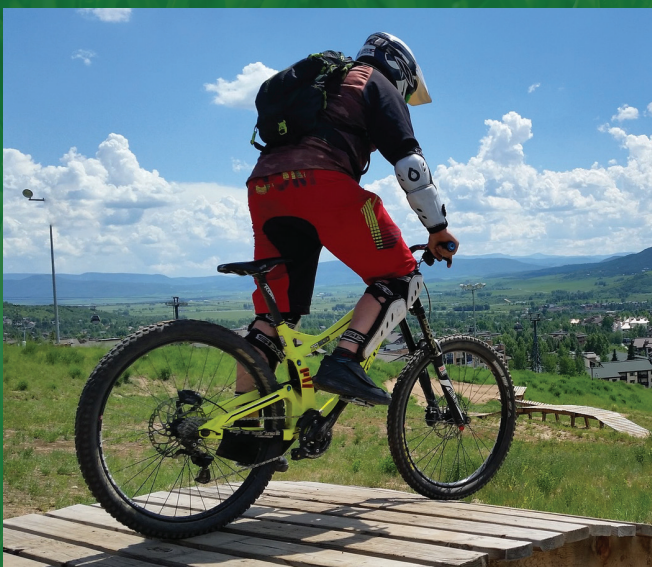
לִרְכֹּב עַל אוֹפִנִים